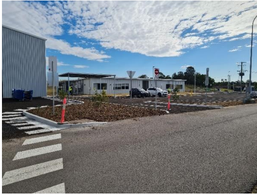
Figure 1: Completed Depot with landscaping