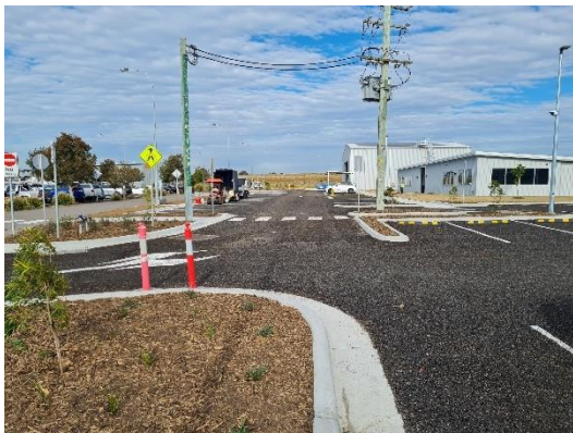
Figure 5: Completed car park, depot and landscaping