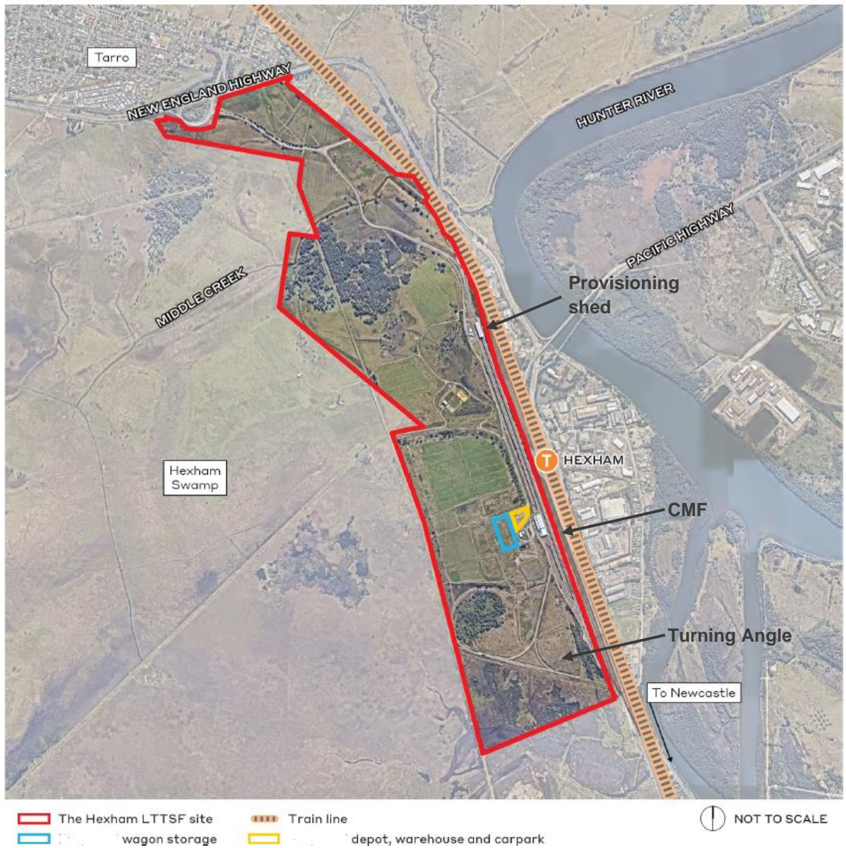
Figure 1 - Project Regional Context