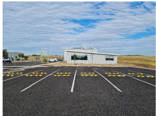
Figure 6: Completed car park depot