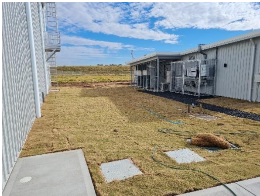
Figure 3: Laid turf