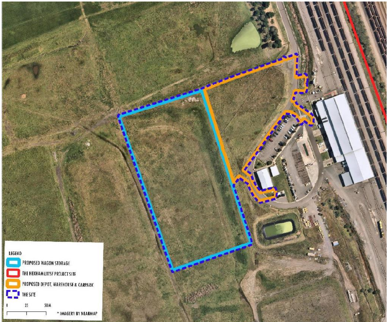
Figure 2 – Project Boundary and Alignment