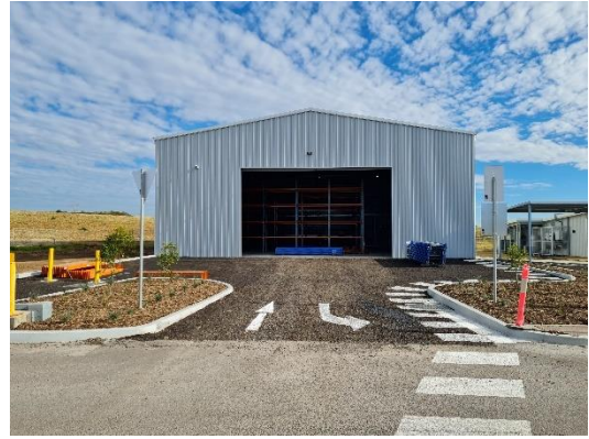
Figure 2: Completed shed