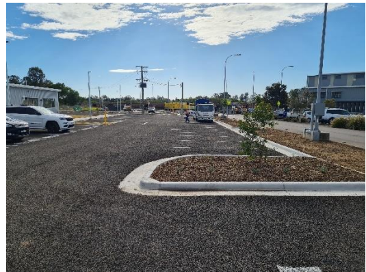
Figure 4: Completed car park and landscaping